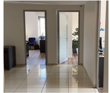
Scenes from the third floor of Atatürk Bulvarı 154 in the BIAA's new, expanded premises.