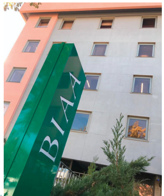
The new Institute premises.