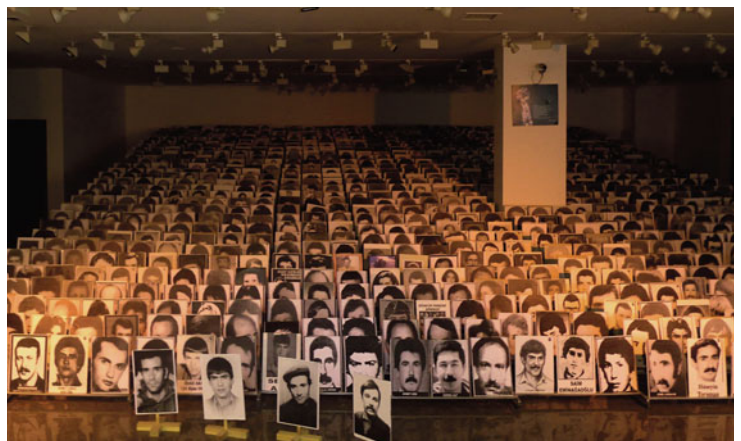
Detail from the exhibition 'The museum of shame', organised by the Federation of the Revolutionary Generation of '78 and presented every September in Ankara on the occasion of the anniversary of the 12 September 1980 coup. Its purpose is to commemorate and honour the 'lost comrades' assassinated or disappeared during the turbulent 1970s, 1980s and 1990s.