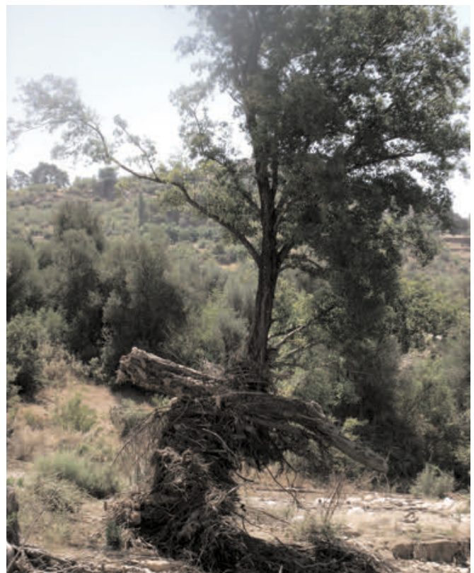
Damage to trees caused by the floods of winter 2011